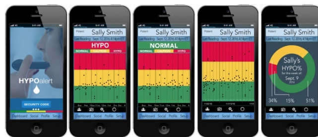
Figure 2. First iteration of the HYPOalert static interfaces. First interface displays the app splash-page. All remaining interfaces indicate the patient's name and reading date/time. Interfaces 2-4: (1) Three color-coded visualization areas: Green=NORMAL, Yellow=APPROACHING (or Caution), and Red=HYPO, and (2) Hourly indication of breathing times and their location on the HYPO visualization scale. Interface 4 displays the patient's weekly breathing summary, broken down in percentages.

Based on a preliminary review of existing diabetes products and mobile applications, we developed a series of exploratory static/rapid interfaces for inspection by diabetes patients. As outlined, the primary purpose of HYPOalert is to warn patients of an approaching or existing state of HYPO. For this reason, the initial interfaces reflect this primary functional aspect. Figure 2 illustrates the first conceptual iteration of HYPOalert. Based on this iteration of interfaces, we performed a user requirements study—focusing on understanding user needs through questionnaire, semi-structured interviews, and a preliminary review of the first iteration of the mobile app interface design. Findings provided design requirements and the users' overall perception and interest in a breath smart sensor app for supporting HYPO monitoring.