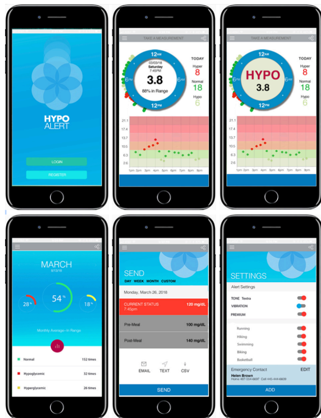
Figure 3: Illustrates the HYPOalert interactive interfaces that focus on data monitoring using several temporal systems, the alert system, along with reminders, settings, and summary reports.

Findings from the first iteration and the review of the two BG monitoring systems informed our design of the interactive prototype (Figure 3) of phase two. Usability testing using the interactive prototype (on an iPhone 7 Plus) is currently on the way—consisting of three parts: (1) a scenario task-based time-on-task study, (2) a post-test questionnaire, and (3) a post-test interview.