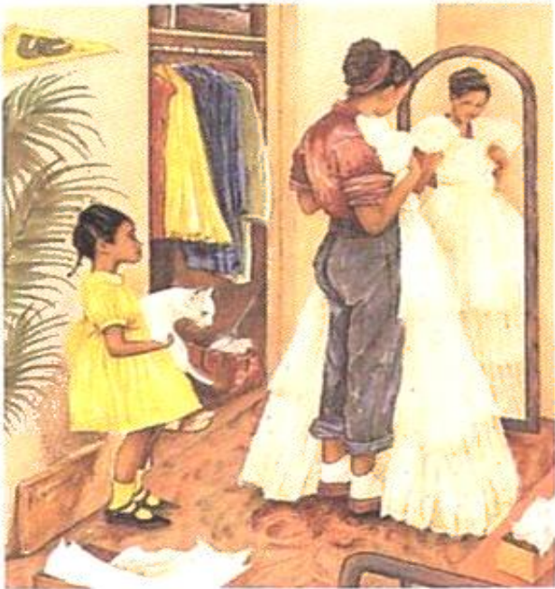
ONE LAST LOOK FREDERICK DOUGLASS