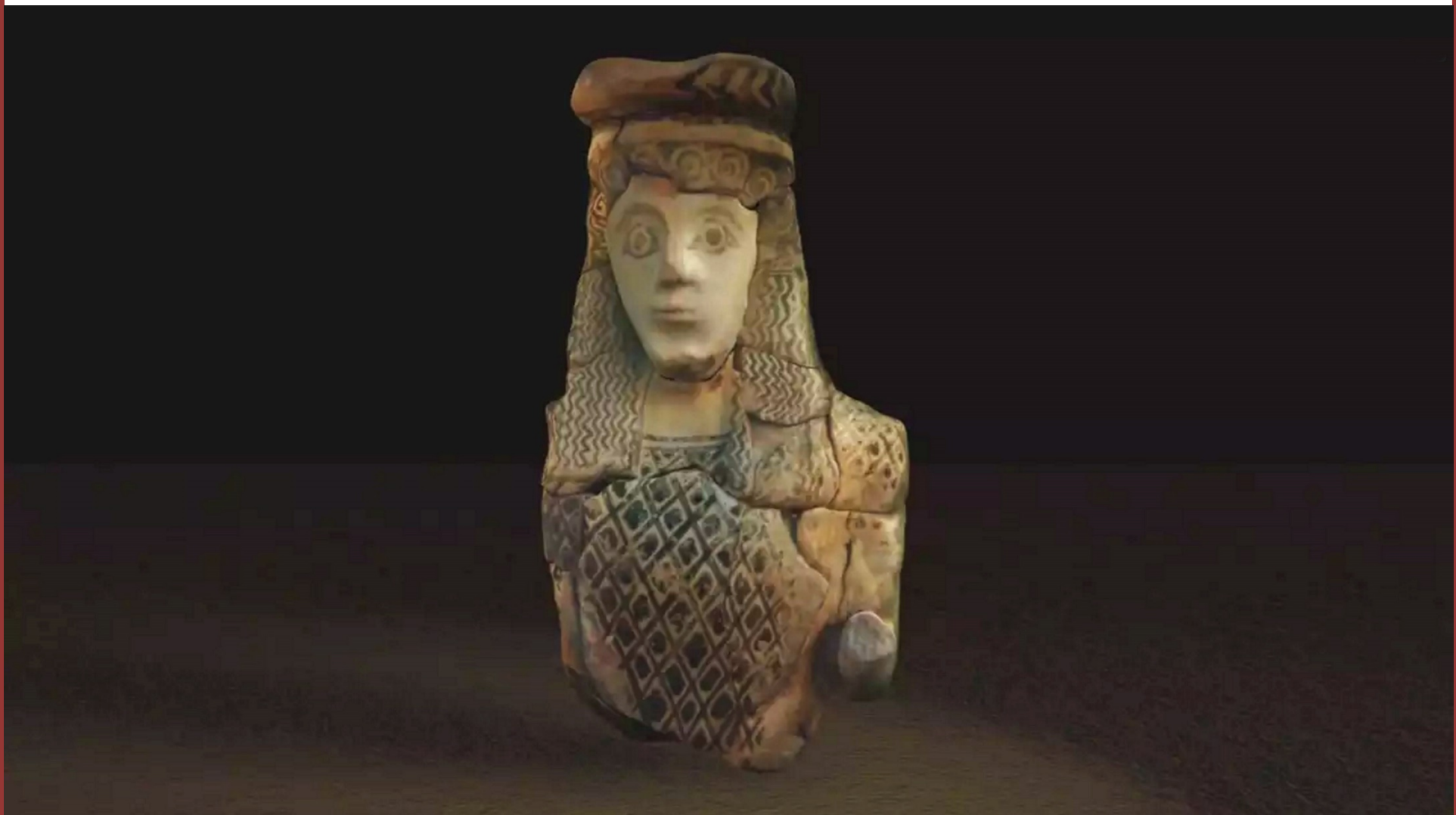
Digital recreation of a statue of Apollo, a significant cultural artifact