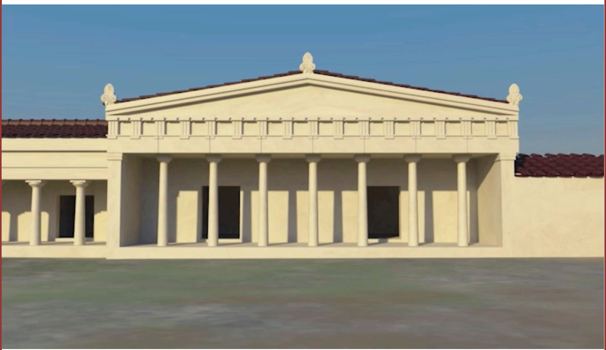
Digital recreation of the Temple of Apollo sanctuary on Despotiko