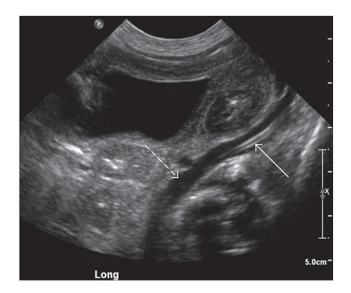
FIGURE 3: Sonographic imaging demonstrating the umbilical catheter (solid arrow) within the left iliac vein (dashed arrow) in close proximity to the bladder.

An ultrasound with Doppler assessment was performed to accurately determine the positioning of the line. The aorta was found to be unremarkable and without an intraluminal catheter. Instead, the catheter was identified within the inferior vena cava, with the tip positioned at the lower cavoatrial junction (Figure 2). Confirming previous radiographs, the course of the catheter involved a caudal loop inferiorly and to the left, before coursing superiorly and to the right.