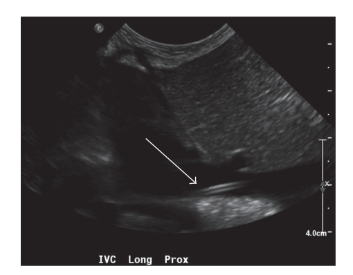
FIGURE 2: Sonographic imaging demonstrating the tip of the catheter (solid arrow) within the inferior vena cava (and not within the aorta). Also note that the size of the inferior vena cava is prominent.

At 12 hours of life, the patient became hypotensive and did not respond well to fluid resuscitation. Given the constellation of complications, the decision was made to transfer her to the tertiary care children's hospital for genetic assessment and cardiologic consultation. Upon arrival, the patient remained in respiratory distress and was hemodynamically unstable, and the placement of an umbilical catheter was attempted. A portable chest radiograph demonstrated a caudal loop of the catheter prior to ascending to the superior abdomen, so the catheter was assumed to be within an umbilical artery. However, the tip of the line was ultimately located to the right of the vertebral column (Figure 1(a)). Given this unusual position of the catheter, a cross-table lateral radiograph was performed. This demonstrated the tip of the umbilical line projecting over the expected location of the right atrium, at the level of the lower thoracic spine, and anteriorly and to the right of the expected position of the aorta (Figure 1(b)). A subsequent portable radiograph was obtained the following morning, redemonstrating the atypical position.