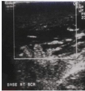
FIGURE 2. Patient with significant scrotal wall edema mimicking scrotal abscess.

The findings of significant scrotal wall edema on ultrasound examination of patients with idiopathic scrotal edema are most likely underreported in the literature. This is consistent with the disease process and together with findings of normal testicular blood flow, would assist in confirming the diagnosis in patients with suspected idiopathic scrotal edema, and permit conservative management with the avoidance of unnecessary scrotal exploration.