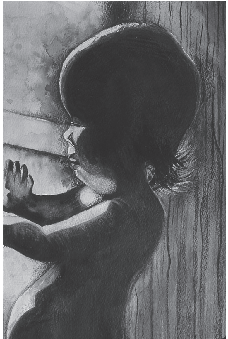
In the Window by Briana Price 2'x1' Watercolor on Paper