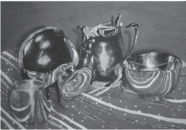
Reflections by Briana Price 2'x1' Acrylic on Paper

instantaneously removed from the table. I test my tea. The flavor reminds me of spinach, which I love. I continue to sip from my small, white cup. The girl returns before my cup is empty