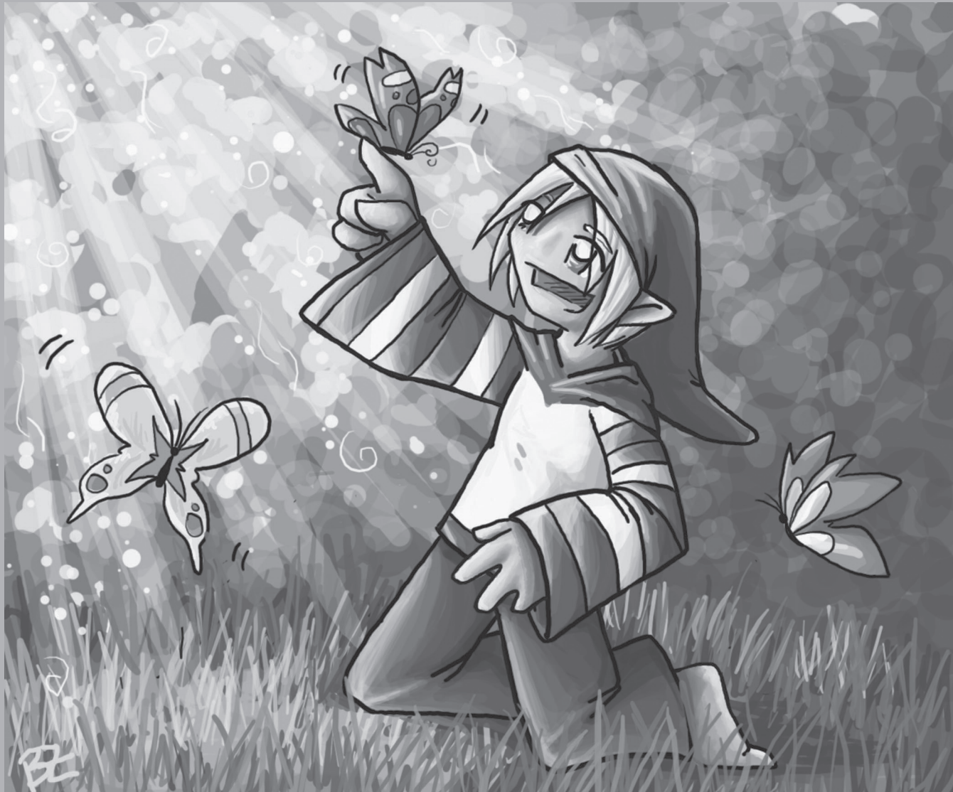
Follow the Butterflies by Beth Zyglowicz Digital