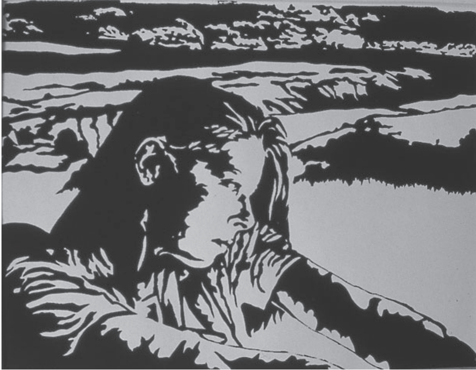
Self-Portrait by Briana Price 9"x7.5" Silk Screen Print