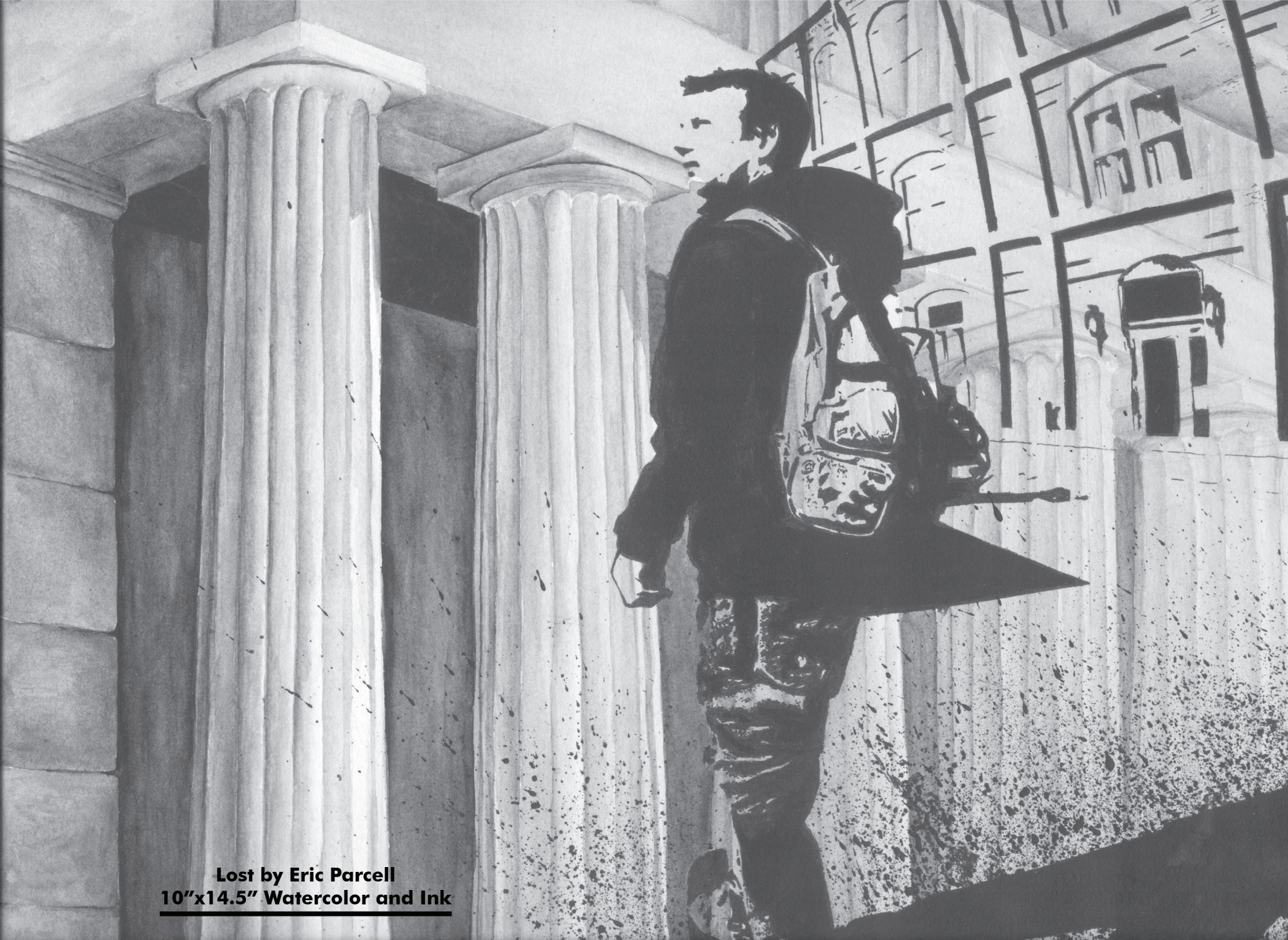
Lost by Eric Parcell 10"x14.5" Watercolor and Ink