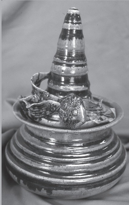
Fish Bowl by Briana Price 10"x6" Ceramic Bowl