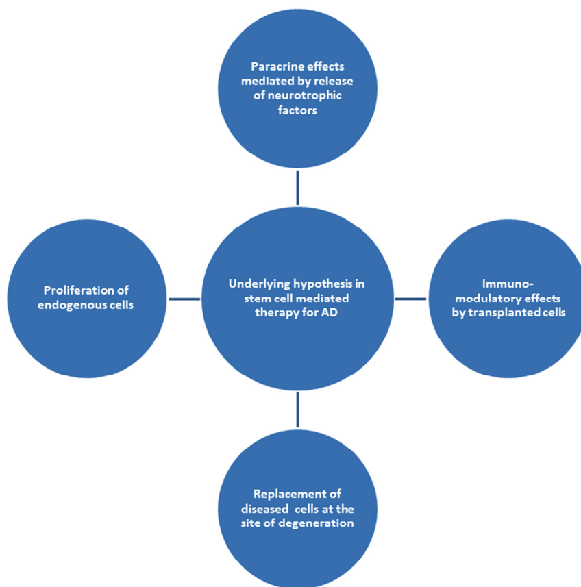
Fig. (1). Outline for underlying mechanism in stem cell mediated reversal of AD pathology. Some underlying hypothesis may explain functional improvements in subjects of stem cell transplantation in AD. However, current experiments point to four possible explanations. A) Paracrine effects from release of neurotrophic factors by transplanted cells. B) Immunomodulatory effects by transplanted cells. C) Replacement of diseased cells by transplanted cells. D) Proliferation of endogenous cells. It is likely that all four processes operate in interaction to produce any final salutary effects.

Several animal studies and human brain biopsies have revealed the pathological hallmarks of AD, including extracellular amyloid- \beta ( A\beta ) plaque deposits and formation of intracellular neurofibrillary tangles (NFT). NFT are misfolded structures produced by aberrant phosphorylation of microtubule-stabilizing tau proteins. The process of A\beta formation is known to play a significant role in AD etiology [16]. Amyloid plaques trigger a pathological cascade resulting in neurofibrillary tangles and neuroinflammation causing neuritic dysfunction, which ultimately leads to neuronal death. In AD patients, excessive accumulation of Amyloid plaques is likely to be due to dysregulation of activity of \beta -site Amyloid Precursor Protein-Cleaving Enzyme 1 (BACE1). BACE1 gives rise to A\beta from the membrane-spanning A\beta precursor protein (APP). This is the rate limiting step of A\beta production. This cleavage occurs at the APP N-terminus to form soluble APP \beta , and the c-terminus is further cleaved by \gamma -secretase complex, which yields A\beta_{40/42} [17]. These A\beta fragments thus generated aggregate to form amyloid fibrils. A\beta_{40} (with 40 amino acid residue) is the predominant form but A\beta_{42} (with 42 residues) is more fibrillogenic than its shorter sibling and is involved in disease pathology.