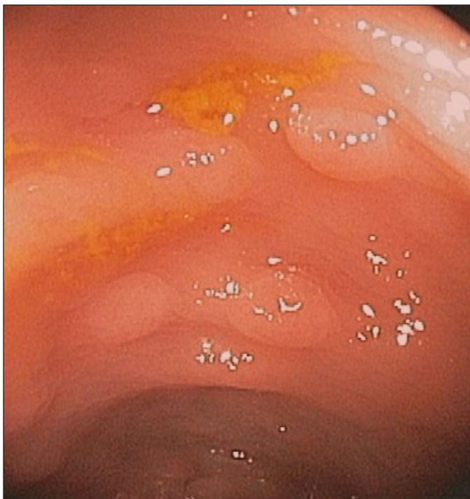
Figure 1. Endoscopic photograph of colonic polyps.

No such criteria exist for BRRS, but the syndrome is suspected in the presence of macrocephaly, hamartomatous intestinal polyposis, and pigmented macules of the glans penis in males, all of which were present in our patient. In addition, he had a presumably associated benign thyroid manifestation. In the absence of definitive diagnostic criteria for BRRS, a scoring system has been developed to assess the likelihood of a PTEN mutation based on the constellation of clinical findings in a patient suspected of having the condition. 1 It should be noted that some authorities feel that