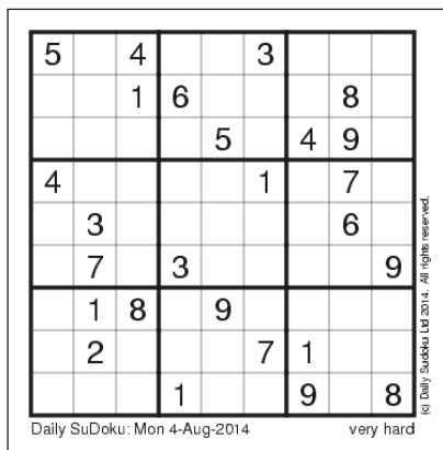
Figure 1. The daily Sudoku on the day this article was written.

Figure 1 shows an example of a Sudoku puzzle that appeared in [1].