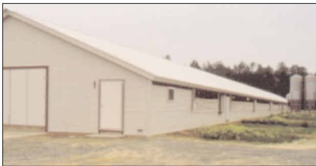
A biosecure broiler house protects poultry flocks from coming into contact with wild or migratory birds.