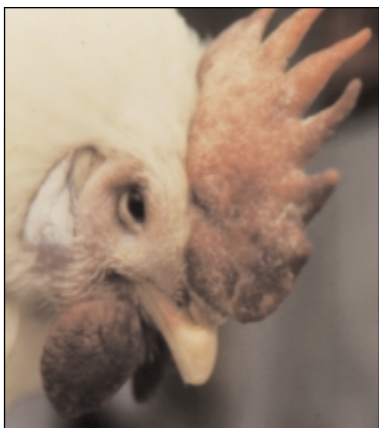
Birds affected by HPAI may show swelling of the head and face.