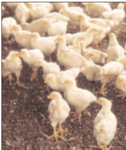
HPAI can devastate a healthy broiler flock, leaving high rates of mortality and economic losses.