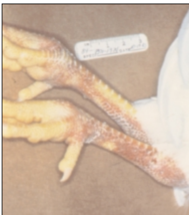
Hemorrhaging of the skin and legs is just one of the signs birds may exhibit when infected with the virus that causes HPAI.