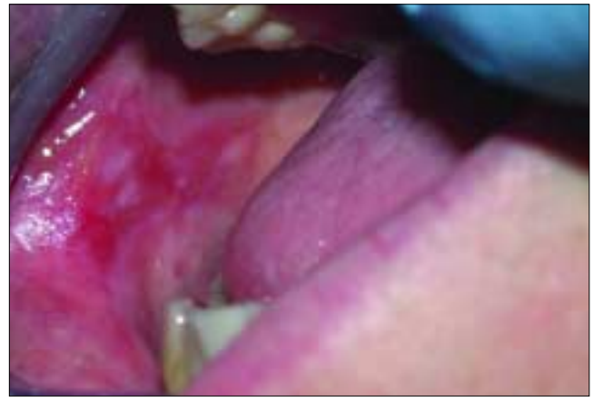
Figure 4: Erosive oral lichen planus involving the buccal mucosa. The condition is characterized by erythematous areas and interspersed pseudomembranous areas.