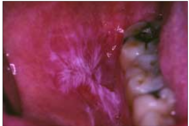
Figure 2: Reticular oral lichen planus involving the buccal mucosa. Numerous interlacing white keratotic lines are evident.