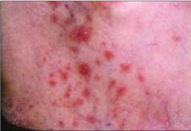
Figure 1: Cutaneous lichen planus on the flexor surface of the wrist. The condition presents as purple, polygonal, plaque-like lesions.