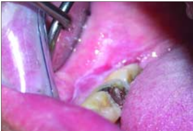
Figure 5: Erosive oral lichen planus involving the unattached gingiva.