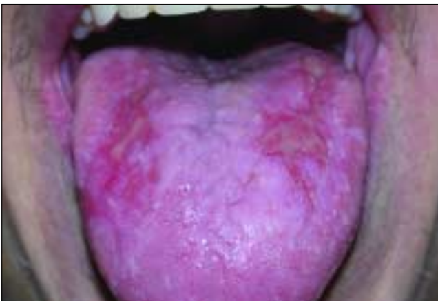
Figure 3: Plaque-type variant of reticular oral lichen planus with erosive areas involving the dorsum of the tongue.