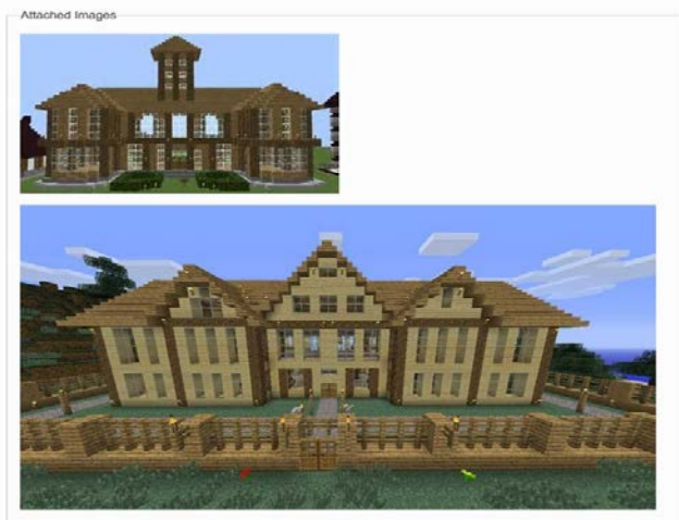
Image 2. Advertisement for a team to build the picture project.

I'll pay the people 10 diamonds each!!!!