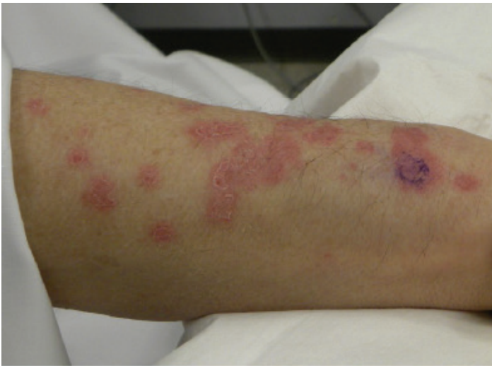
Figure 1: Capecitabine-induced lichenoid drug eruption on dorsal forearm.