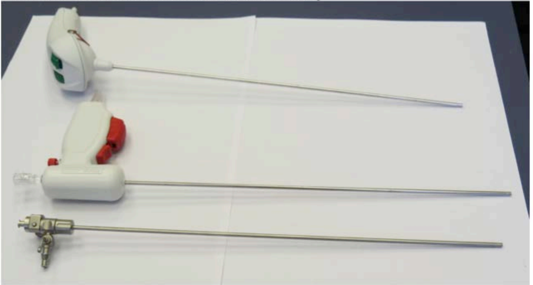
Figure 1 - Photo comparison of the three LSHP (top to bottom: Lumenis® Suction HP, Cook® LithAssist, Storz® LASER Suction Tube)