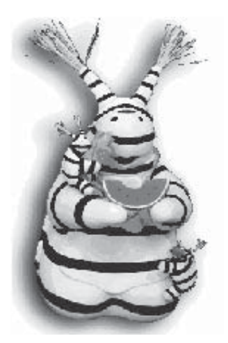
ILLUSTRATION 1. The Hopi Koyala (Koshari) are considered to be Clown Kachinas. They behave in the manner of Pueblo clowns, engaging in loud conversation, inappropriate actions and of course, gluttony. They are often drummers for the dances.

American Indians are different in their relationship with the federal government than other minority groups, in that their tribal governments have a formal relationship with the U.S. Government set forth in the Constitution, treaties, statutes and various court decisions. No other ethnic group in this country has this relationship. Interaction between federally recognized tribes and the federal government is that of a government-to-government relationship and, by treaty, the United States agrees to provide certain benefits to tribal groups.<sup>2</sup> Historically this relationship has generated many federal documents and continues to do so.