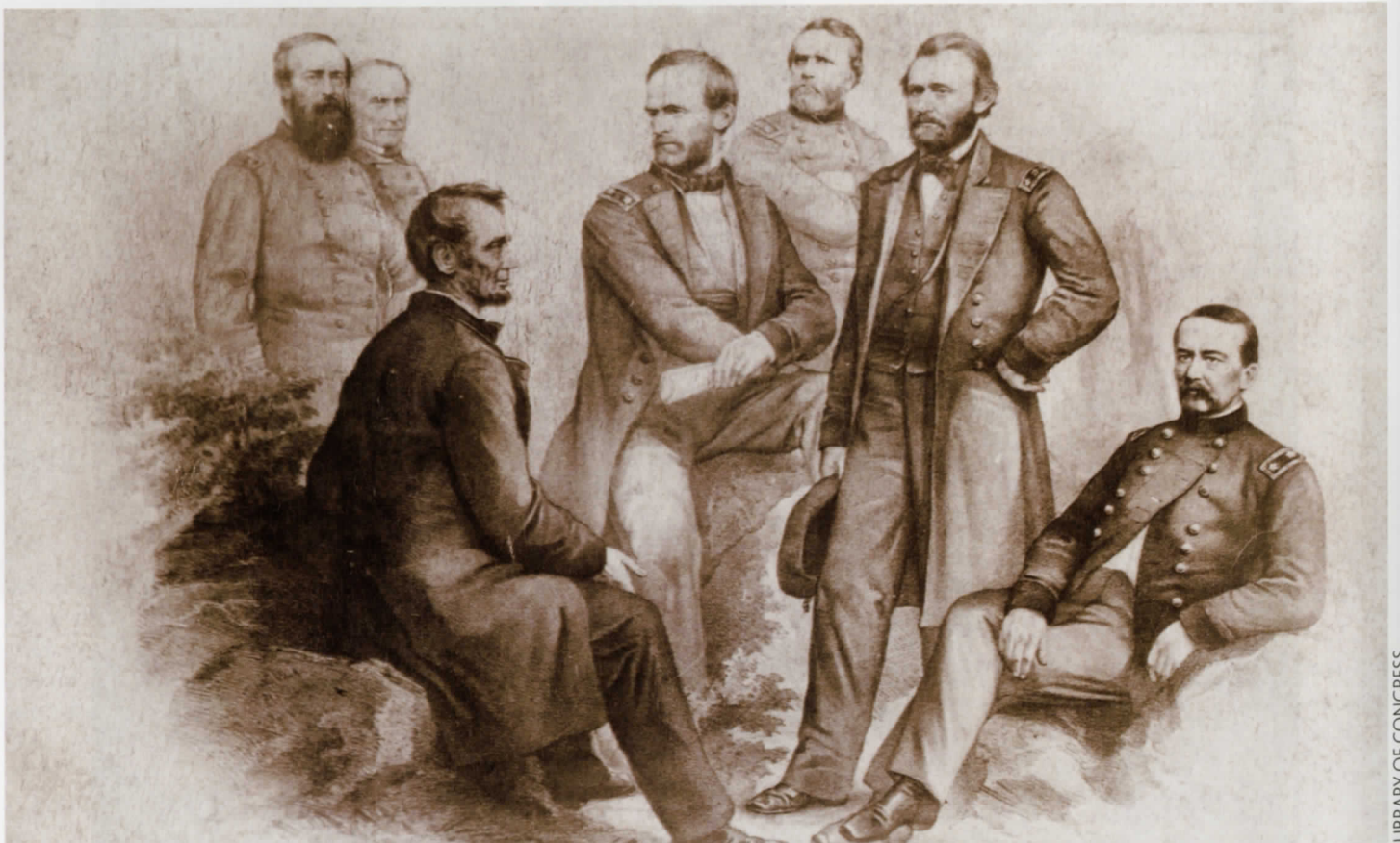
An 1865 print imagining President Abraham Lincoln meeting with the leading Union military officials, from left: General Andrew Porter, Admiral David Farragut, Lincoln, General William Tecumseh Sherman, General George Henry Thomas, General Ulysses S. Grant, and General Philip Sheridan.