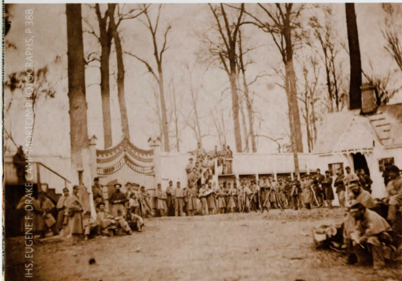
Above: Camp Morton garrison troops huddle near prison entrance on land that is today bordered by Nineteenth Street, Talbot Avenue, Twenty-second Street, and Central Avenue. The fence around the camp was constructed of two-inch-thick oak planks. Opposite: Colonel (later General) Henry B. Carrington.

Ohio's first Republican governor, abolitionist Salmon P. Chase, recognized Carrington's military ambitions and appointed him judge advocate general of the state militia. When Dennison succeeded Chase as governor in 1859, he retained his law partner in the position, later appointing him adjutant general of