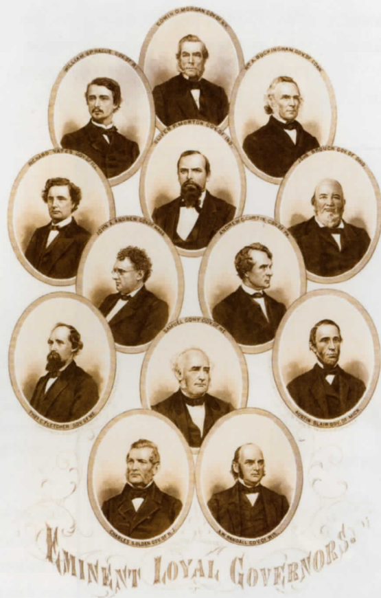
Engraving listing eminent loyal governors of the Civil War (from top clockwise): Edwin D. Morgan, New York; William A. Buckingham, Connecticut; John Brough, Ohio; Austin Blair, Michigan; A. W. Randall, Wisconsin; Charles S. Olden, New Jersey; Thomas C. Fletcher, Maryland; Richard Yates, Illinois; William Sprague, Rhode Island; Morton, Indiana; Andrew C. Curtin, Pennsylvania; Samuel Cony, Maine; and John S. Andrew, Massachusetts.