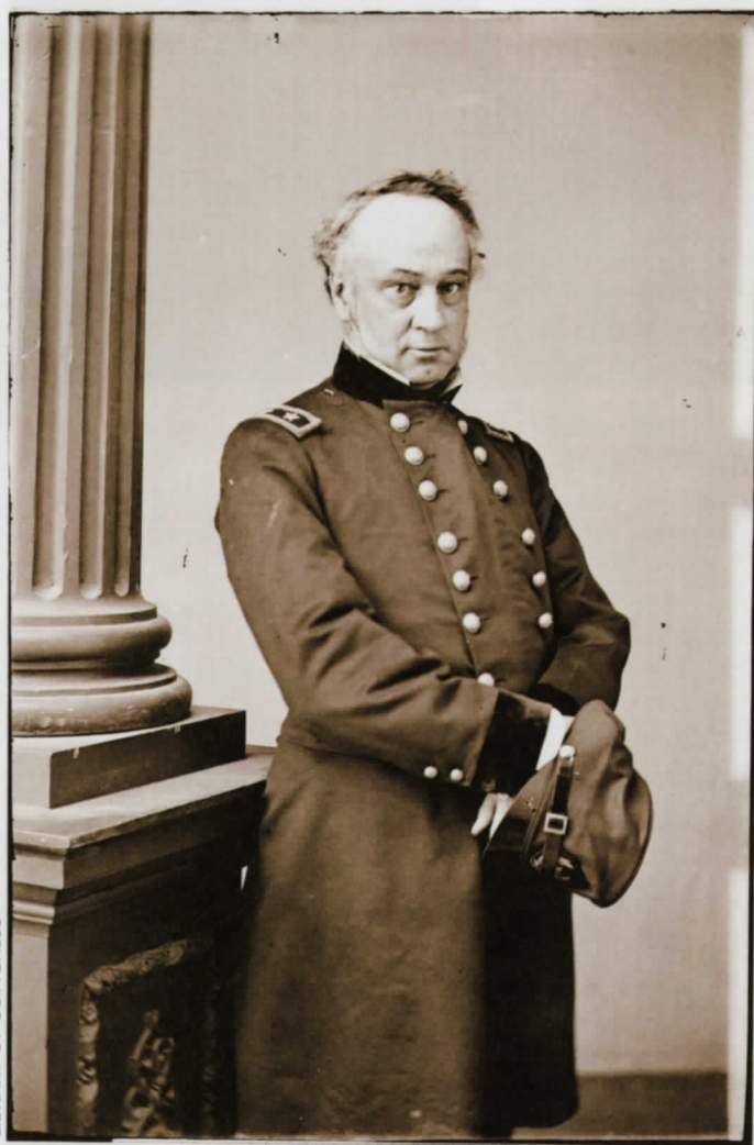
Top: As a pro-war Democrat, former congressman William H. English of Indiana supplied Carrington with information on the August 1864 plot to release Confederate prisoners from Camp Morton. Above: General-in-Chief Henry W. Halleck was a cautious battlefield commander, but excelled at administrative work. President Lincoln once described him as "little more than a first rate clerk."

Shortly thereafter, however, the new general fell from grace. U.S. Army General-in-Chief Henry W. Halleck resented that Carrington had risen to high rank without having seen battle. In April the new commander in the Midwest, Major General Ambrose E. Burnside, acted on Halleck's suggestions and removed Carrington from his Indiana command. Sent to Cleveland, Ohio, to organize new troops, Carrington fell sick with diphtheria and languished in an idle funk. In July, however, Morton obtained orders to bring him back to Indiana just in time to organize the effort to repel Morgan's invasion