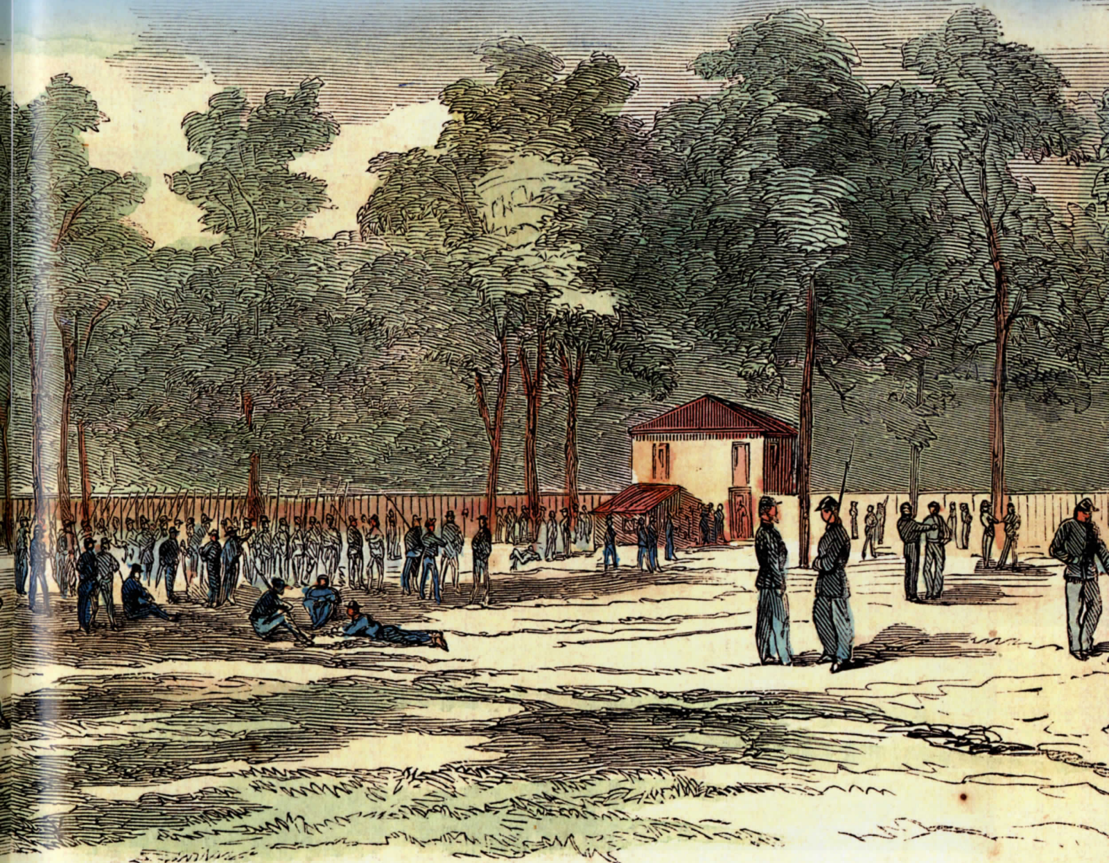
A Harper's Weekly drawing of newly enlisted Union soldiers training at Camp Morton in Indianapolis at the site of the former Indiana State Fairgrounds.

The U.S. Army officer most responsible for preserving Indiana from danger during the Civil War was a Connecticut Yankee who never saw battle. Although he yearned for action, chance denied Henry Beebee Carrington the opportunity to fulfill his dreams of martial glory. Small, frail, and sickly, he did not fit the mold of a soldier either in the mid-nineteenth century or today. Nevertheless, he fought for the Union from behind a desk and employed his gifts as an organizer and administrator. Thanks to his efficiency, tens of thousands of Indiana troops went to the field to put down the Confederate rebellion. But Carrington's greatest service to Indiana and the Union was in his role as perhaps the most important spymaster during the Civil War—a task that fell to him by chance.