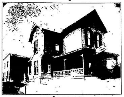
Ward's Sanitarium. 315