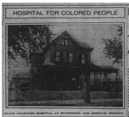
Sisters of Charity Hospital<sup>317</sup>