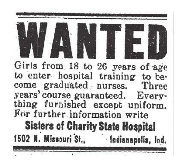
Figure 1. Newspaper Advertisements for Nurse Training Schools<sup>150</sup>

Although hospitals were the site of formal training, they were not a major source of employment for the graduate nurses. Many hospitals, staffed mostly by student nurses, employed trained nurses only for supervision or teaching. Student nurses, as exploited labor, carried the bulk of work in both white and black hospitals. In 1910, City Hospital