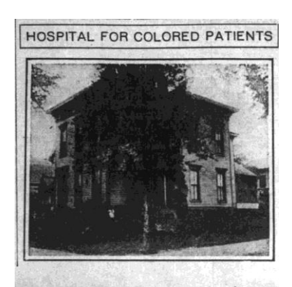
The Lincoln Hospital<sup>316</sup>