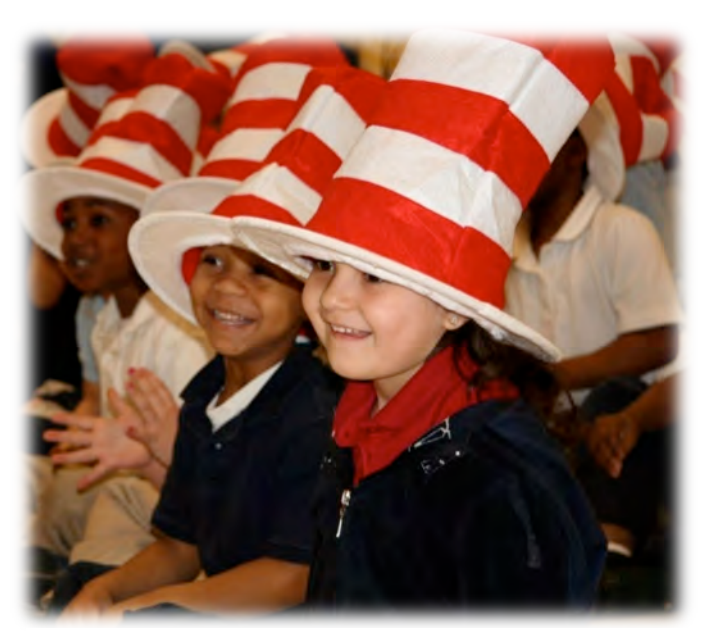
IPS School 63 K-2 grade students attending Dr. Seuss Day celebration.

After being closed for 25 years, IPS School 63 reopened in 2006 in the Haughville Community to help