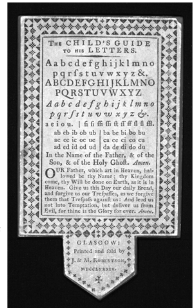
Image 4 - Hornbook, no.21, Lilly Library

The Princess Royal's First Step to Learning , printed between 1860 and 1885, is a later version of a chapbook. There is a similarity of style between this and The Silver Primer . The alphabetical figures are mostly people and animals. It is sometimes shocking to see the examples used to educate children in the past. The caricature of a Jew for the letter "J" seems particularly jarring to 21st-century readers. (See image 6.)