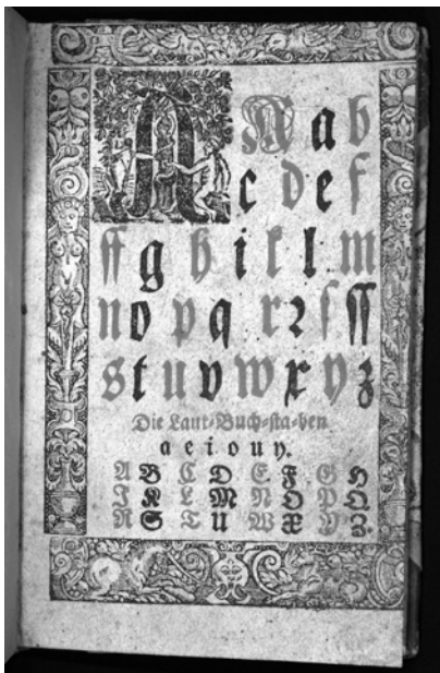
Image 1 - [Alphabet] (n.d.). n.p.: Breslaugedruckt mit Grassischen Schriften.

“I shall beseech you”-That is question now; And then comes answer like an Absey book: “O sir,” says answer “at your best command, At your employment, at your service, sir!” (I.i.)