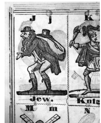
Image 6 - Princess royal's first step to learning. (c.1860). London: Fortey, W.S.