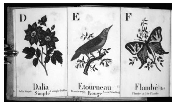
Image 8 - Alphabet d'histoire naturelle: Pour apprendre à lire aux enfants . (n.d.). France: n.p.