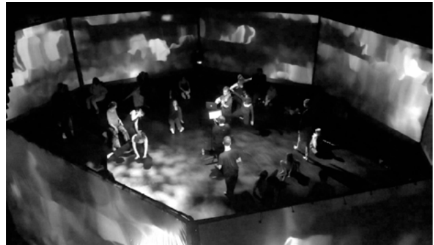
Figure 1. Big Tent performance event.

physical painting or a composition for orchestra. Much work in cutting-edge experimental areas either intentionally or incidentally denies or fails to honor this requirement. In fact, aesthetic research through artistic expression, which is the domain of all creative artists and musicians, can greatly benefit from embracing this model. Supporting experimental replication strengthens the field as a whole and enables more directed and connected creativity and research.