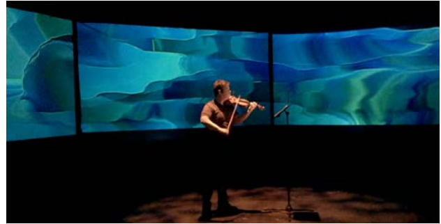
Figure 3. Interactive video and live musical performance inside Big Tent.

Testing the functionality and capabilities of this new hyper-instrument, and exploring the aesthetic potentials, has commenced through several public live performance events and installations. These events and individual artistic pieces worked with a variety of media and interaction models in an attempt to discover the potentials of Big Tent as well as identify technical issues and limitations. The variety of sources and approaches comprise the following modalities (used singly and in combination):