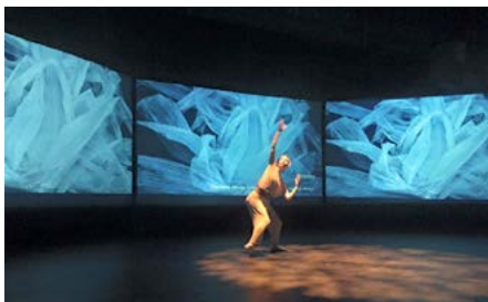
Figure 4. Dance and video in Big Tent.

Big Tent is only viable at dusk and into the night, and when indoors any light source must be low in output and focused away from the screens.